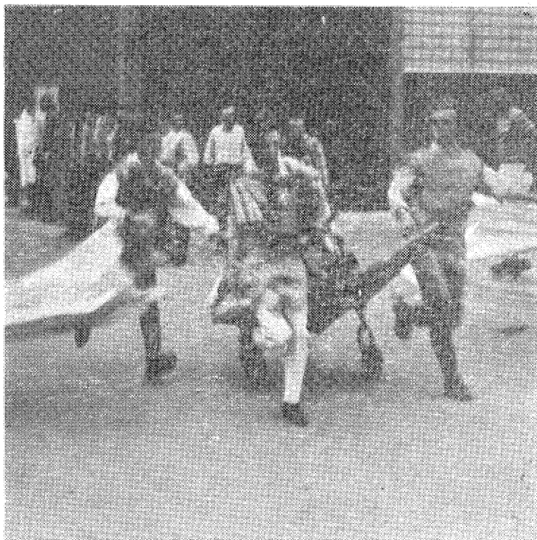
Architectural Technology Frosh charge across the finish line to retain the NAIT Challenge Cup. See page 3 for more photos and a complete (unbiased) write-up.