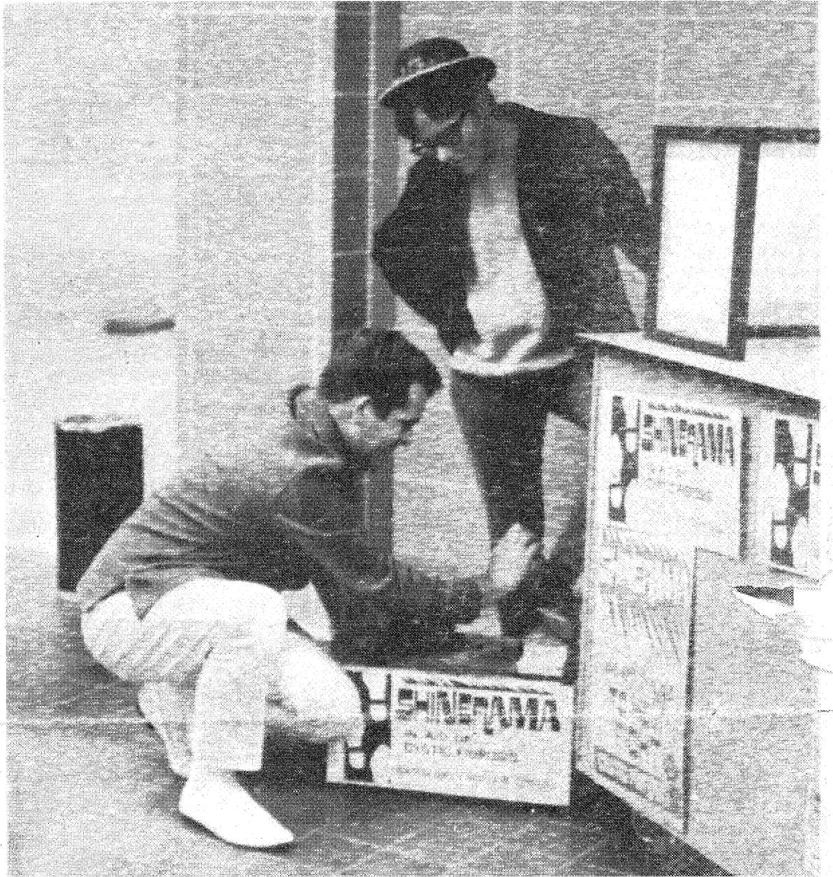
HARDER, HARDER, RUB HARDER