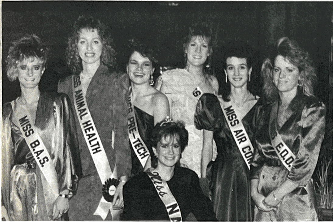
Queen Candidates 1988