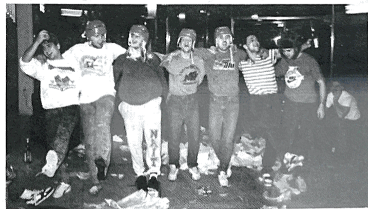
Right: Some of the NAIT players celebrate the festive season with champagne in Czechoslovakia.