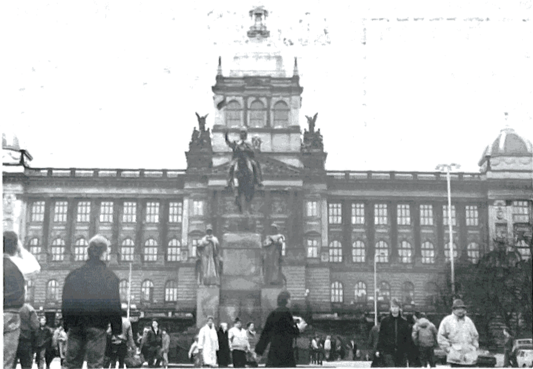
During their stay, the Ooks saw the sights of Czechoslovakia including this museum in Prague.