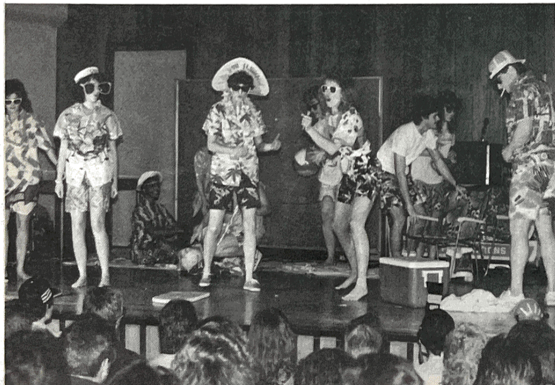
Lip Sync 1988