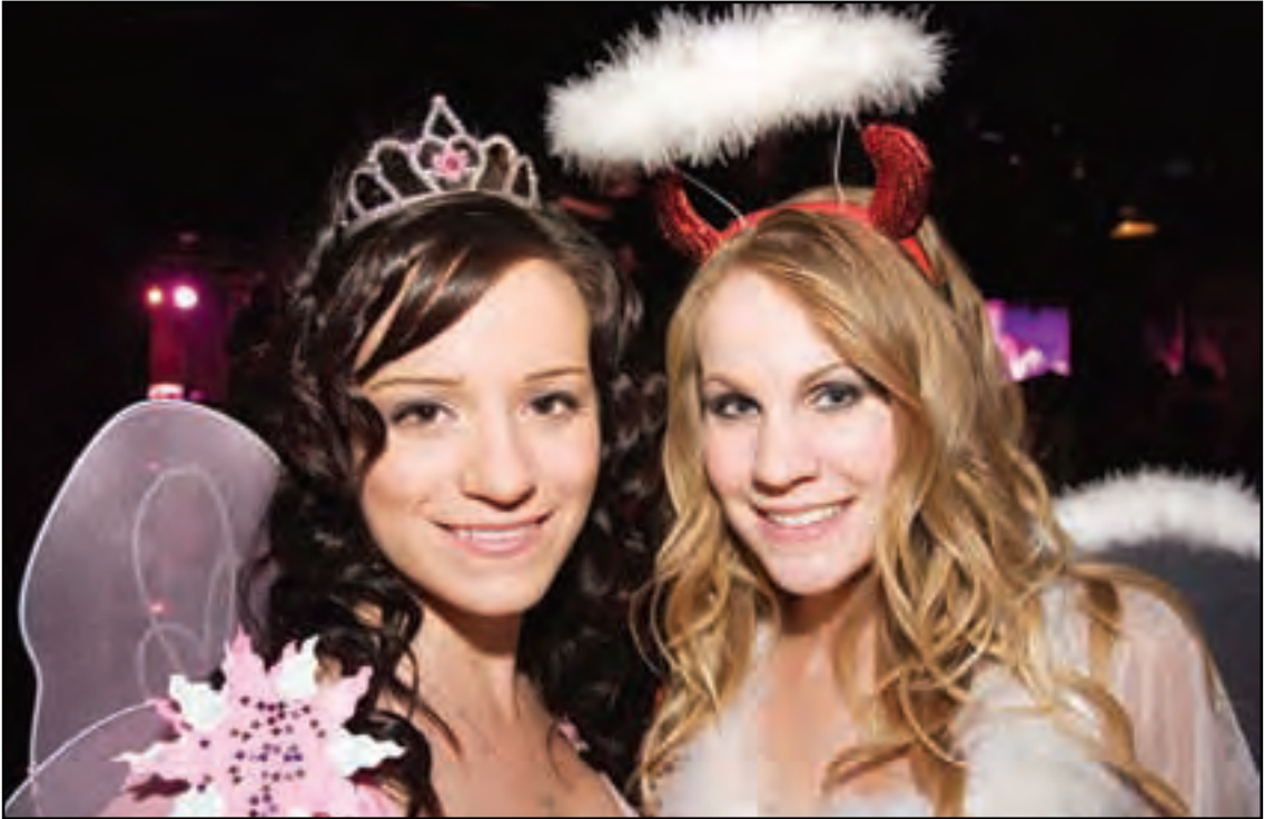
A couple of costume clad cuties at the bash.

rocknRodgers gives the Default show at the Nest 4 out of 5 devil horns