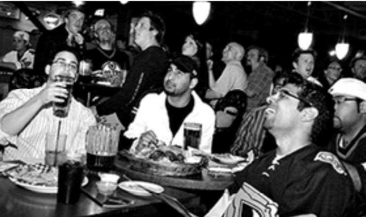
A group of guys enjoying the game at Average Joe's in Sherwood Park.