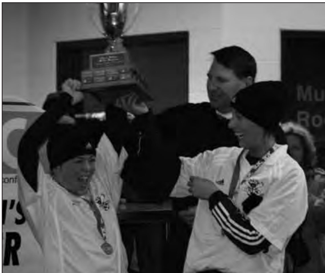
The NAIT Ooks celebrate their emotional championship trophy.