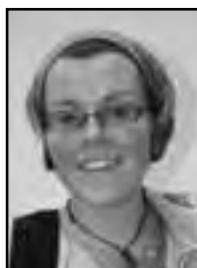
By STACEY DOUGLAS

Meals for a student can often mean a blue box of Kraft dinner or cheese and crackers. Both have protein (cheese), starch (pasta/crackers), and lots of sodium, but they get boring fast.