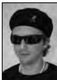
By JONNY FIVE

The much publicized case involving cameras hidden in the ceiling of a women's washroom has ended with the arrest of a former NAIT student.