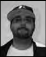
By TAZ DHARIWAL

When I was young and naïve, I used to tell people that in order for the human race to become a powerful, cohesive unit; to make our world free of hatred, discrimination, and all things nasty towards our human brothers and sisters and to free us from the socio-political-economic chains that hold us back, we would need a zombie plague to overrun Earth. Only after the zombie outbreak would we, humans, get together and kick some zombie ass, while praising the human race for settling our differences, and coming together to defeat the zombie menace. Those were the days. During those same days I thought activist pursuits would help change the world; and taking a stance against globalization wasn’t just a passing