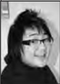
By SHIRLEY TSE