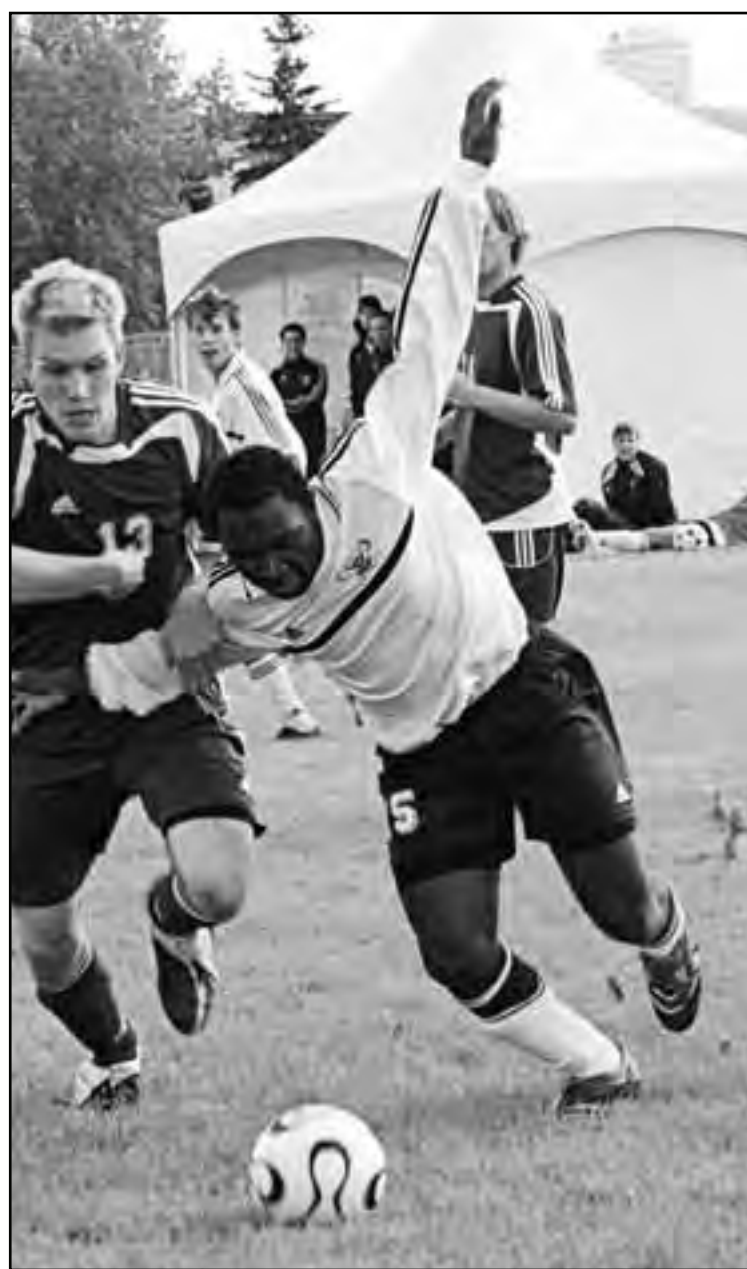
NAIT Ooks Men's Soccer

Men's Hockey is in Camrose on Friday against Augustana, then they host the Vikings on Saturday night (7 p.m.). You can hear the game live on NR92.com.