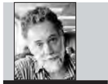
By TIM STEPHENS