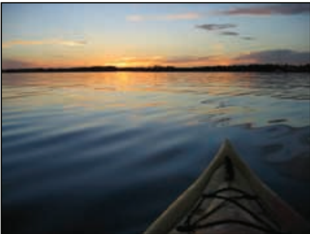
Beautiful sunset at Buffalo Lake, AB. Jocelyn Ouellette