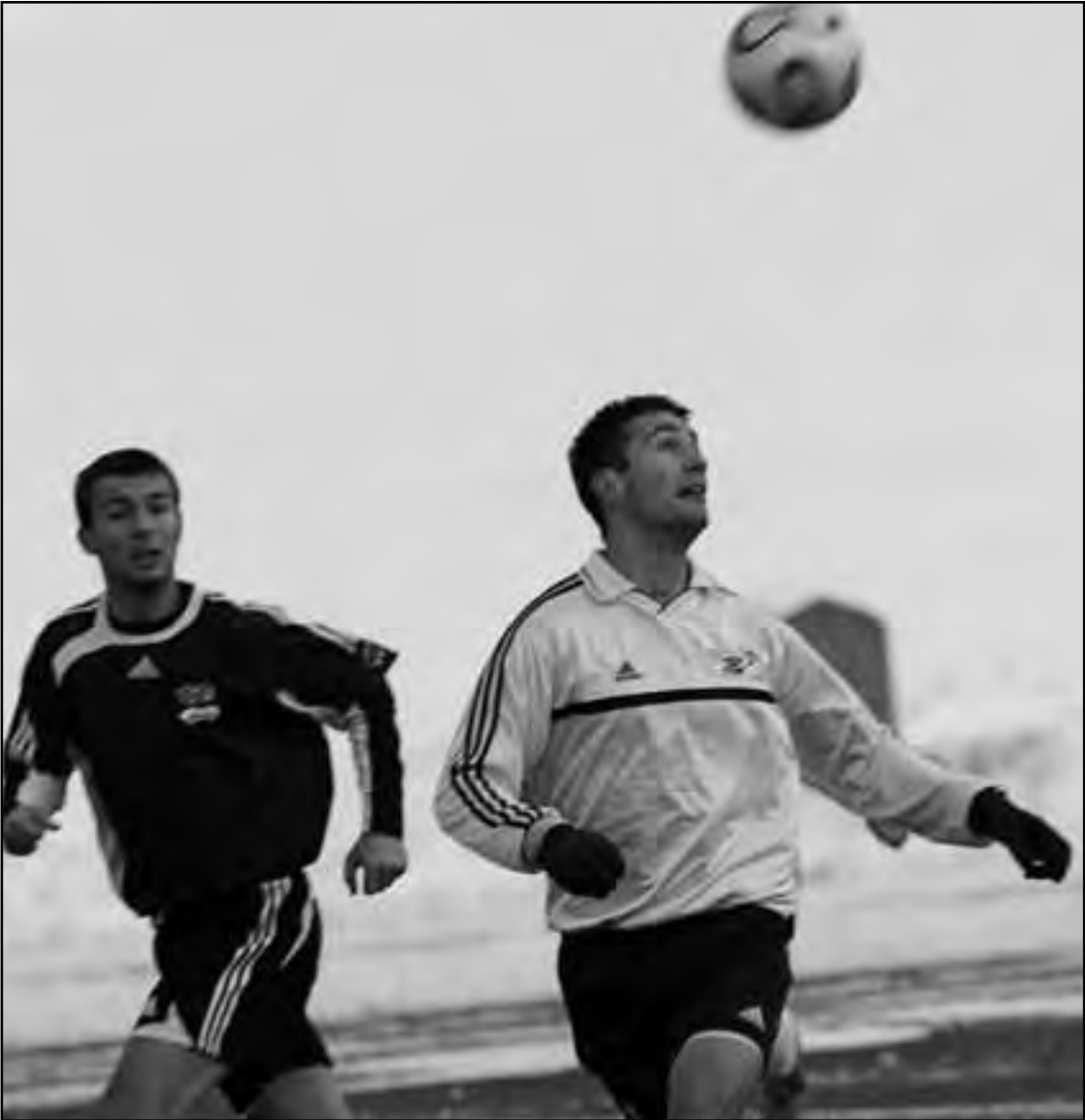
The Ooks Soccer tries for the ACAC Champion against Grant MacEwan Monday.