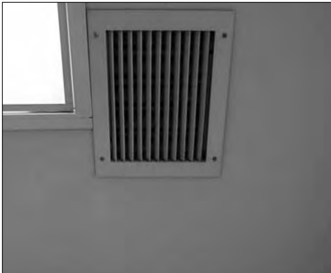
A women's bathroom vent similar to the one where recording equipment was found over the summer by Edmonton Police.