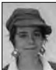
By ERIN MASTRE

"We also have to make sure it operates at a maximum level for everybody...this is really for and about NAIT students."