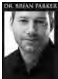
Ask the Sex Doc: