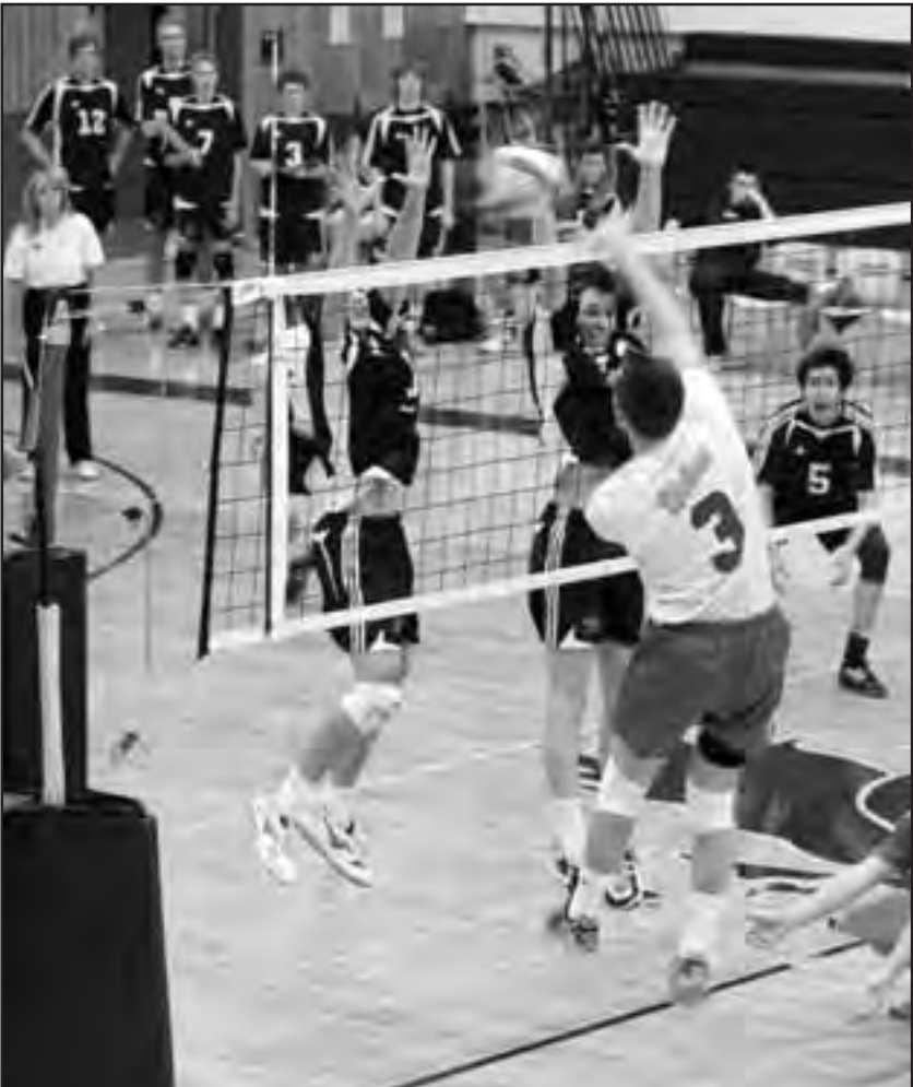
GPRC player spikes the ball at NAIT November 25th at 2pm in the main gym.

All we have to do as students is go out to a game and support these hard-working individuals. They deserve to look into the stands and see signs with their team colors painted on it. They deserve to hear the chant of their school name. They deserve fans!