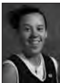
By BRIE BURROWS Diary entry #2

This is our time. Having a week-end off, a bye weekend, now is our time to work on everything. Coach decided that we were going to go back to the basics. The fundamentals are what we need to refine in order to reach the success in which we as a team have to come up with. Two weeks of practice without a game can be mentally draining.