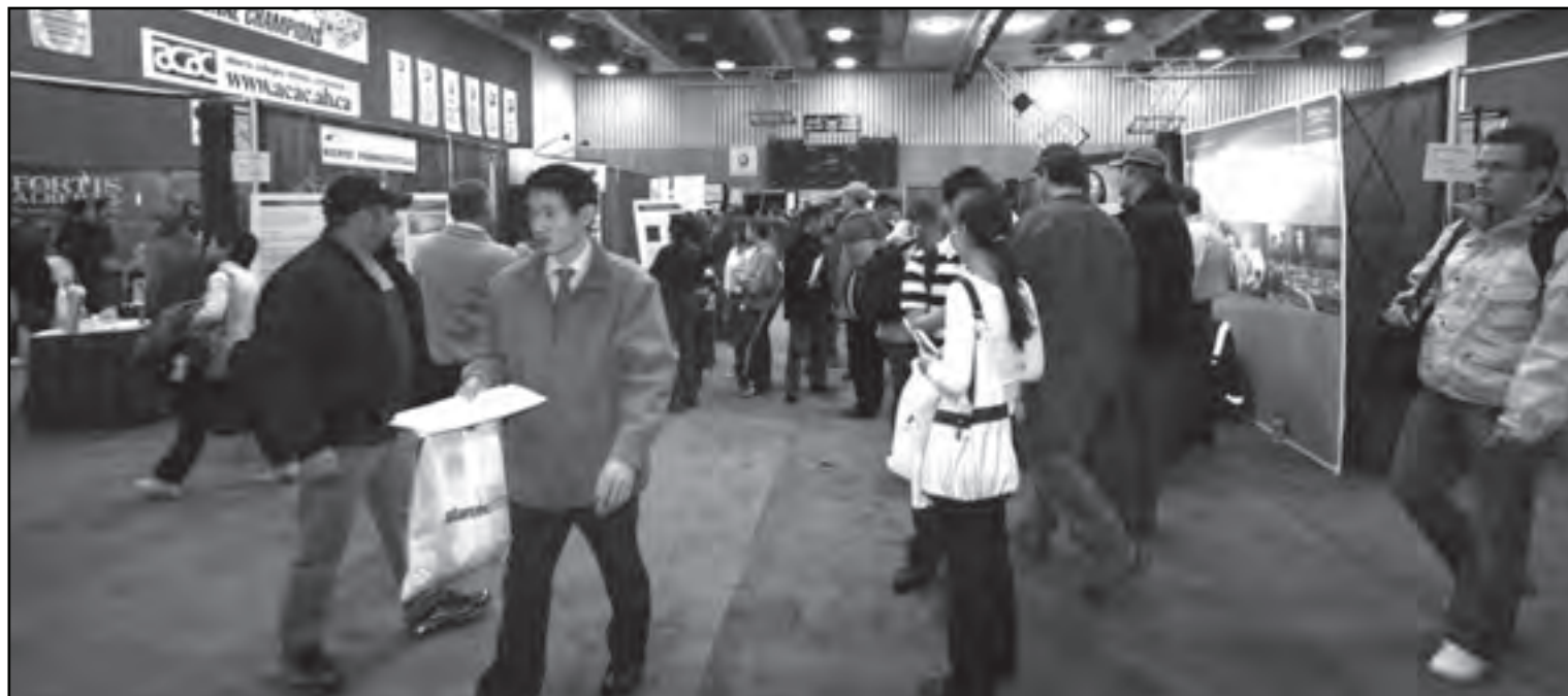
On November 23rd NAIT hosted a Career Fair in the North Lobby, South Lobby as well as in the Main Gym. There were 135 companies that came out to try and recruit potential employees.