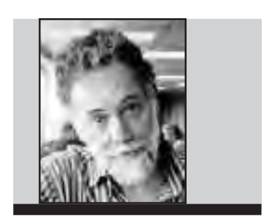
By TIM STEPHENS