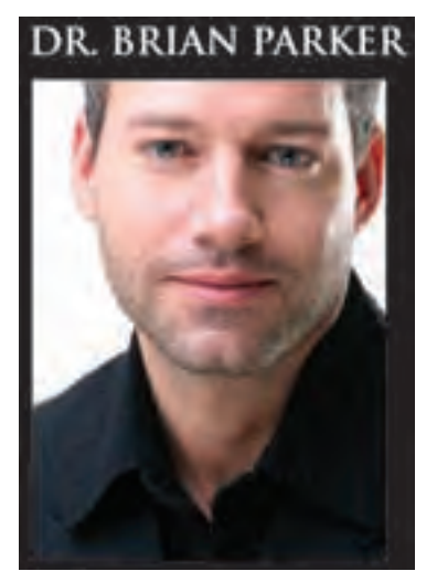
Dear Sex Doc;

The last time I was getting head from my partner I lost my wood. To make matters worse, this happens quite often. Why does this happen to me and what can I do to stop it from happening in the future? Fanshawe Flaccid Fellow