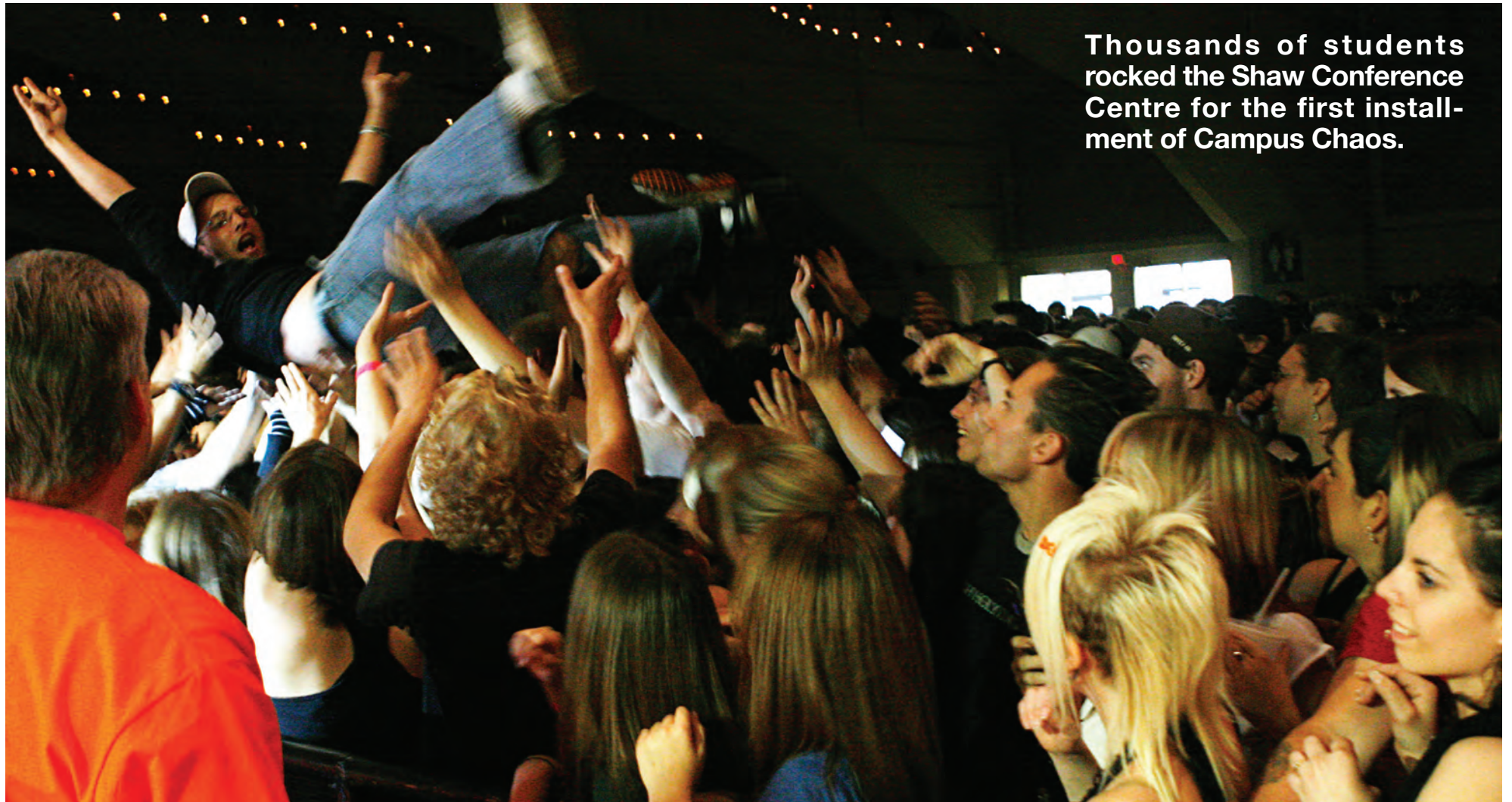
Thousands of students rocked the Shaw Conference Centre for the first installment of Campus Chaos.

— After an early glitch, Campus Chaos was all that anyone could hope for —