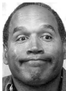
O.J. Simpson In trouble again

Of course, maybe they're right. Maybe this kind of drivel is what the public wants to see and the networks are only serving their viewers. If that's the case though, I hope O.J. gets you all!