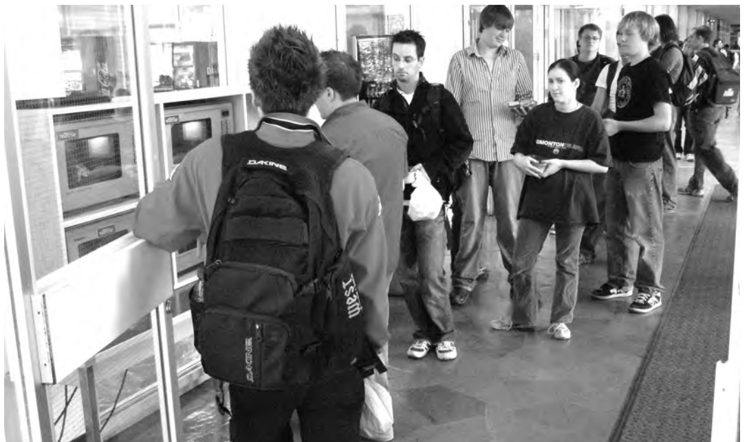
The usual noon lineup at the microwaves at a high-traffic intersection down the hall from the Common Market.

Such small steps. The first is identifying and declaring the problem. Done. Now let's take the next few.