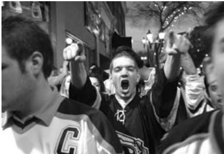
Oilers fans are the best!