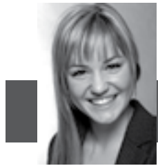
By BRITTANY BLACK Assistant Issues Editor

NAIT is one step closer to getting that U-Pass that has been flowing through the airwaves for a few weeks and the results from last week's survey showed some interest in getting one. The survey was open to NAIT students for close to six weeks (I'm sure you knew this) and almost 1,500 students completed it.