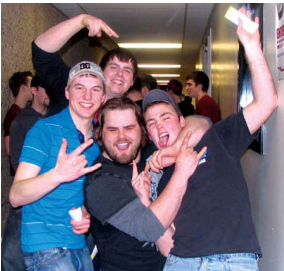
Empty the Nesters whoop it up as they wait in line to get into the Nest.