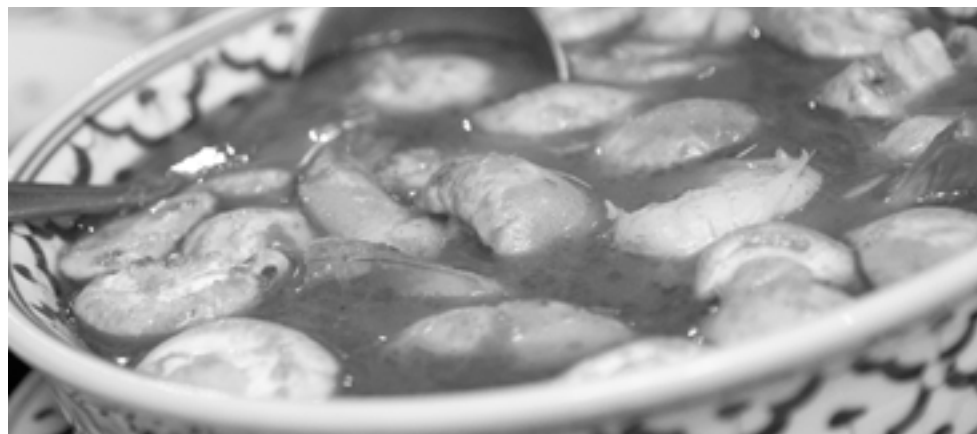
Tom Yum soup