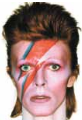
www.vam.ac.uk David Bowie Name familiar?

P.S. If The White Stripes ever got back together, I might have died upon hearing that news.