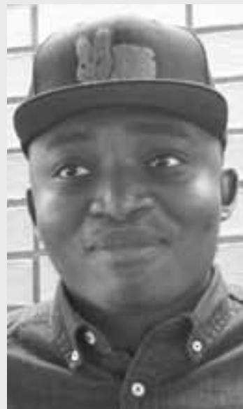
Navneet Computer Network Technology

"Just bend down and give a rose to someone."