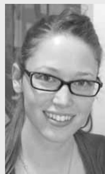
Romeo Geological Technology

"Put some effort into it! He should plan it out and do it in the summer in a private setting. Take a hike in Maligne Canyon and at the bottom, pop the question."