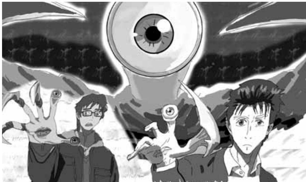
Parasyte: The Maxim

If you are a fan of sci-fi horror, this is definitely an interesting watch. The pace does not move quite as quickly as I would like sometimes but there is a variety of elements to keep you interested. It brings a new perspective on alien body snatching that can really pique the imagination.