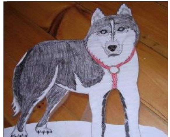
Our guard dog at MYD. Yes, his bark is A LOT worse than his bite!