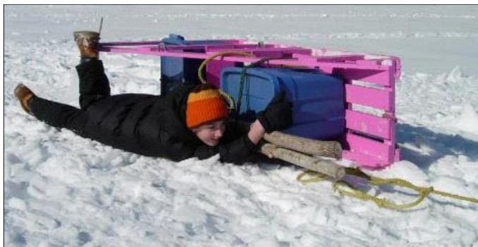
"WE'VE FALLEN, AND WE CAN'T GET UP!" -At The Ice Rescue Station.