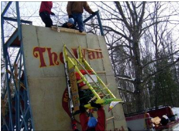
No obstacle is too big; not even "The Wall" is too high for dedicated Royal Rangers to conquer!