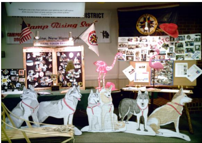
NNED's displays and banners make its presence known at Regional Conference.