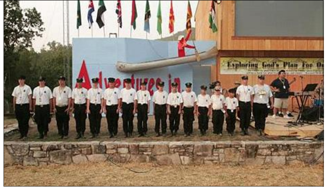
A Proud Moment: Security Color Guard at Camporama 2006.

moment to pray for the Security Color Guard, for all boys and men of that elite corps of servants everywhere: past, present, and future. Pray also to hear if the Lord's leading is for you to become a part of that unsung brotherhood. The next SCG Camp would potentially be in 2008, to help men and boys get "Ready" for the exciting opportunity to be involved in this dynamic program! Also, next time you see our proud Security Color Guard, take a moment to stop and talk to them, and thank them. They truly are "servants behind the scenes", and a vital part of the NNED Royal Rangers mission of "Reaching, Teaching, and Keeping Men and Boys for Christ"!