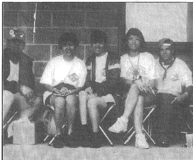
Singapore delegates enjoying a little time off in the busy day

In yesterday's issue the National Ranger of the Year picture and the FCF Candidate for National Scout and Assistant National Scout were switched. Sorry!