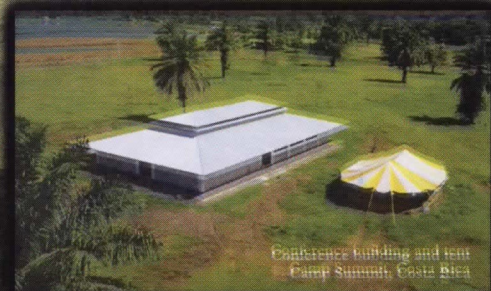
Conference building and tent Camp Summit, Costa Rica