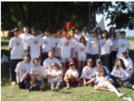
Royal Rangers in Macedonia (Eastern Europe) involves five different evangelical denominations.

and programs and that you involve your church's children pastor or youth leader. Make sure you also visit the child's parents. Parent visits are an essential part of the Royal Ranger ministry and often you will find that other members of the family are ready to receive Christ as well. The child has the best chance of connecting with the local church if the whole family is invited to attend & encouraged to participate. Remember to always keep the pastor informed.