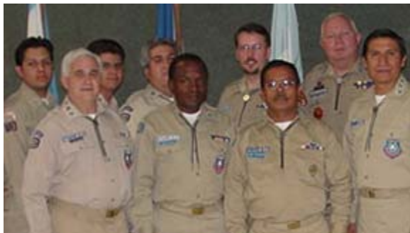
Example of leaders in the Chain of Command for Latin America and the Caribbean (RRLAC).