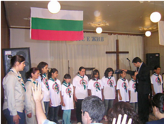
The pastor of the church in Mezdra, Bulgaria blessing the children of the local outpost.