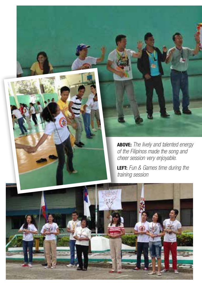
▲ A patrol sharing their song during morning parades.