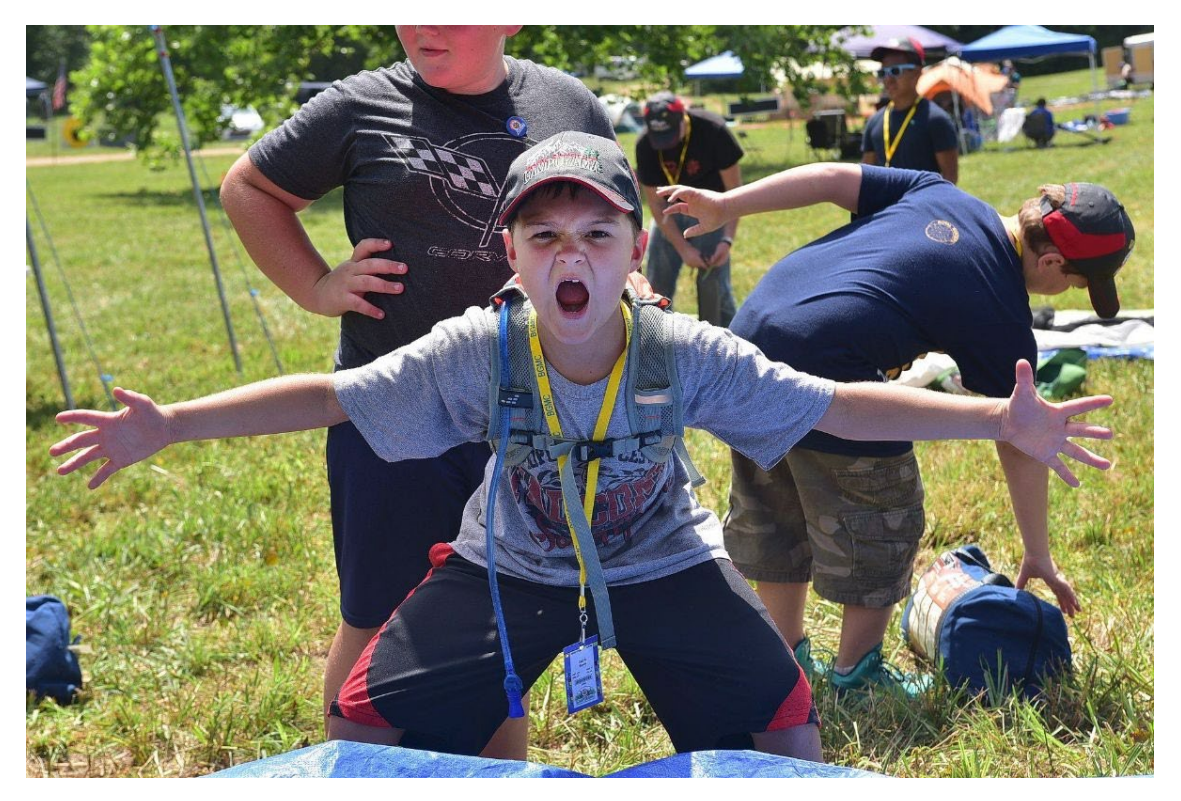
You may be asking WHY do we need The Ready Foundation.

The Ready Foundation will extend grants to advance the goals of the National Royal Rangers ® program in the areas of training, marketing, promotion, and program materials.