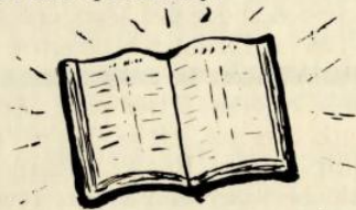
The Best Textbook!

CEREMONY: Fellows, in Royal Rangers, the test sheets for our conduct is the Royal Ranger Code. Please open your handbook to the Code. Now we want you to take your pencil and grade yourself. Place a grade by each point in the code. If you think you are doing real good, place an "A"; good, grade "B"; fair, grade "C"; if you are failing, grade "F", etc. In the days to come, check your grades often. When you believe you are improving, change the grade. Make a practice of testing your conduct and spirituality.