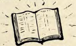
The Best Textbook!

CEREMONY: Fellows, in Royal Rangers, the test sheets for our conduct is the Royal Ranger Code. Please open your handbook to the Code. Now we want you to take your pencil and grade yourself. Place a grade by each point in the code. If you think you are doing real good, place an "A"; good, grade "B"; fair, grade "C"; if you are failing, grade "F", etc. In the days to come, check your grades often. When you believe you are improving, change the grade. Make a practice of testing your conduct and spirituality.