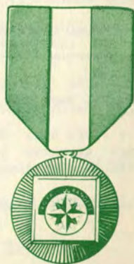
LEADERSHIP MEDAL OF ACHIEVEMENT EARNED BY COMPLETION OF THE ENTIRE COURSE

ROYAL RANGERS • 1445 BOONVILLE, SPRINGFIELD, MO