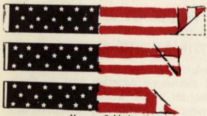
How to Fold the Flag