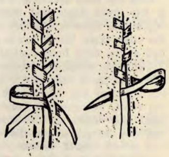
USE DOUBLE OR SINGLE LACING