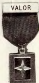
MEDAL OF VALOR (Given to boys for saving a life at the risk of their own)