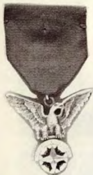
SILVER EAGLE AWARD (Given to District Commanders for outstanding achievement)