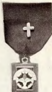
CHAPLAIN'S MEDAL OF RECOGNITION (Given to District Chaplains for outstanding service)