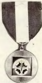
LEADER'S MEDAL OF ACHIEVEMENT (For completing training course)