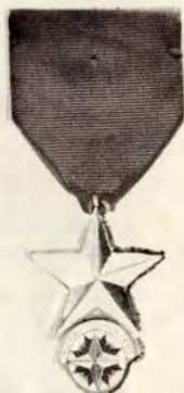
SILVER STAR AWARD (Given to men for outstanding service to the national program)