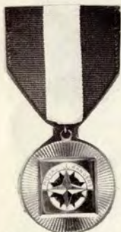
GOLD MEDAL OF ACHIEVEMENT (The top award for Royal Rangers)