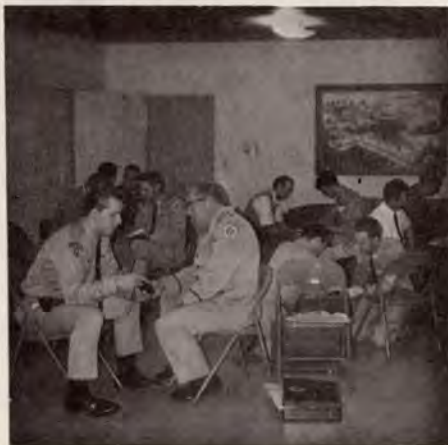
Practical training during class.