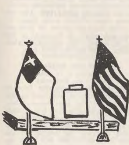
In front of platform