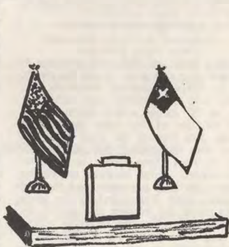
On the platform