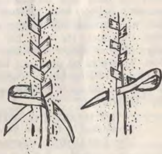
USE DOUBLE OR SINGLE LACING