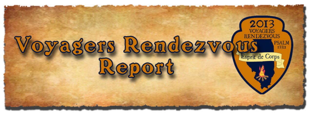
On July 11-13, the Voyagers had the opportunity to meet on the plains of South Central Illinois near the town of Fairfield. All had a great time as they gathered to compete, trade, fellowship and then