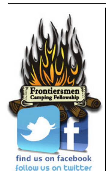
Did you know that you can find FCF on Facebook? Or that you can follow FCF on Twitter?

Order online at <u>www.gospelpublisihing.com</u>