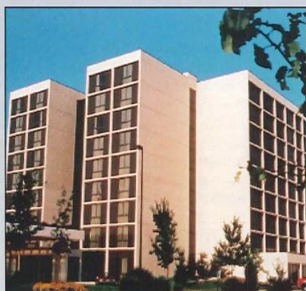
The University Plaza and Convention Center located in Springfield, Missouri is the site of the Royal Rangers National Council.