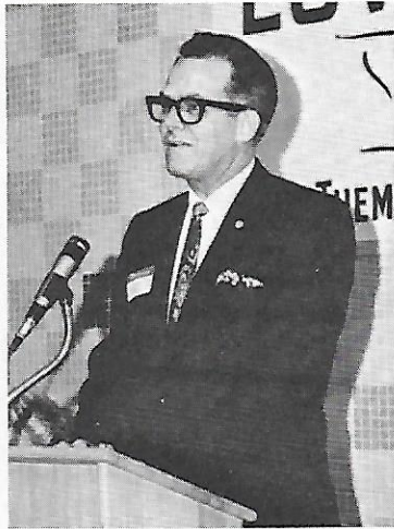
Record giving for Light-for-the-Lost was reported by Phil Sondeno.

SPRINGFIELD, MO.—Growing importance of the work of the Men's Fellowship Department was emphasized at March meetings here of the National Men's Fellowship Committee, the National Action Crusades Council, the National Council of Light-for-the-Lost, and the National Council of Royal Rangers Aides-de-Camp.