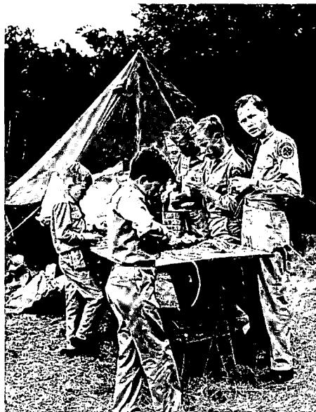
These Fort Worth, Tex., Royal Rangers demonstrate "teamwork" as they work together to prepare lunch.