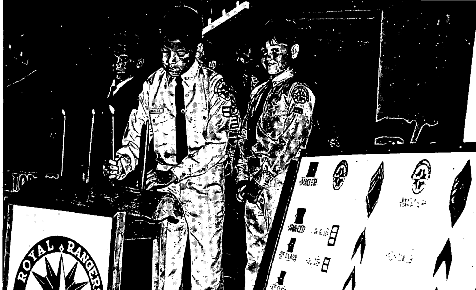
Royal Rangers of Carlsbad, Calif., explain the points of the emblem during an induction ceremony.