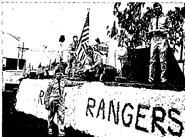
Royal Rangers of Glad Tidings Tabernacle, Everett, Mass., entered this award-winning float in the Fourth of July parade.