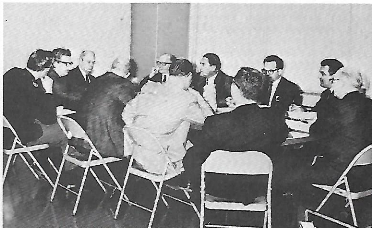
Planning for the following year's Men's Fellowship activities is undertaken by the national MF committee meeting annually in Springfield, Mo. Two laymen from each of the three divisions in the Men's Fellowship Department take an active part in these sessions.

Strengthening the organizational work of the department and coordinating the ministries of the various divisions must be done by the National MF Department officers. To succeed they need the wholehearted cooperation of all our churches, including financial support. This help on Men's Day will be a vote of confidence in the ministry of the Assemblies of God men's department to the men of our churches.