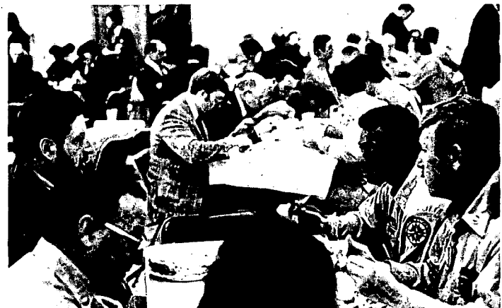
Royal Rangers leaders enjoying fellowship at mealtime.

The next council will be March 15-17, 1979, in Springfield, Mo.