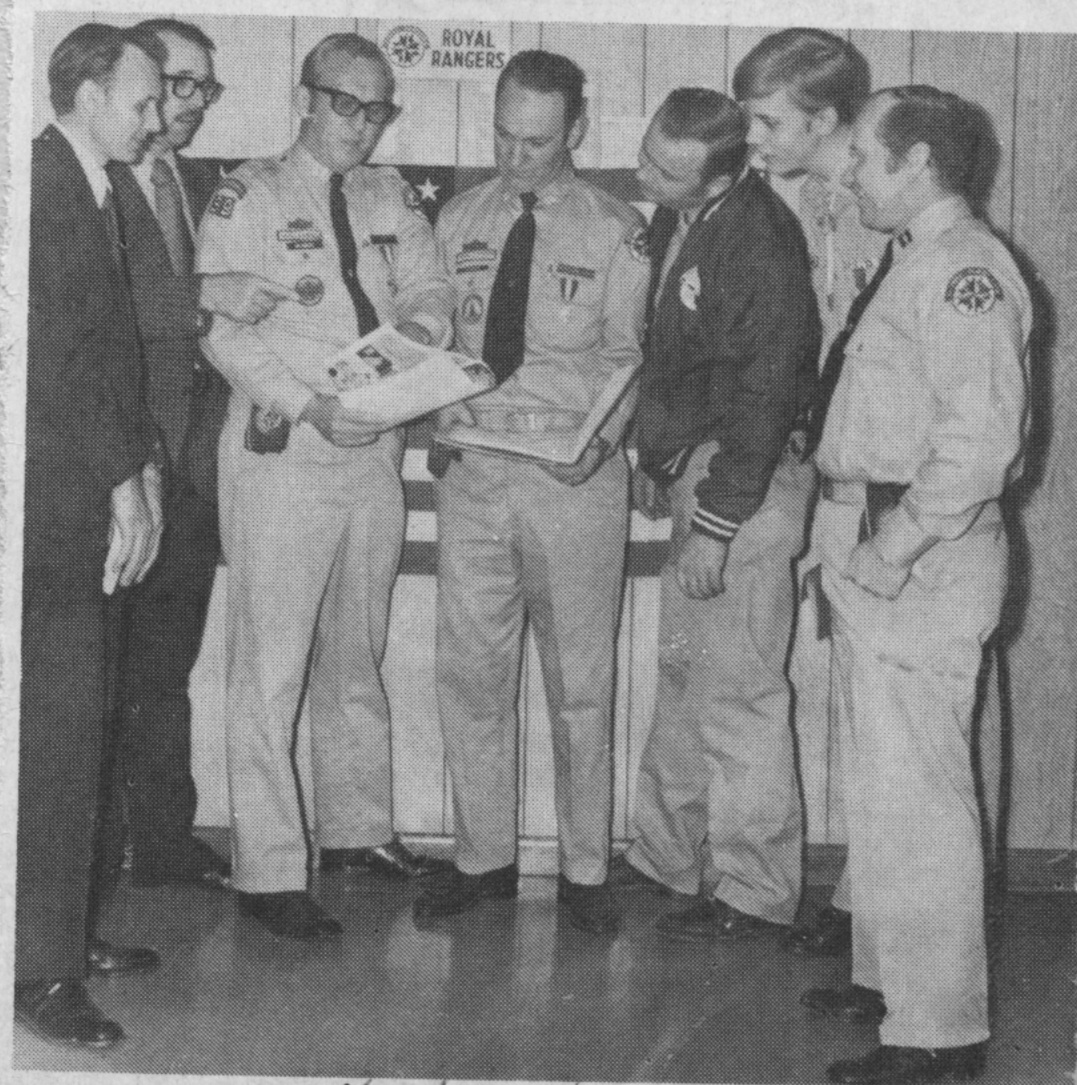
1/13/74 THE PENTECOSTAL EVANGEL