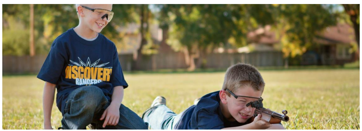
February 20, 2020

Some time ago our National Shooting Sports Program (NSSP) leadership team was tasked with reviewing and updating all Royal Rangers shooting merits to ensure their compliance with current shooting safety practices. They were also given the objective to reduce the number of prerequisite merits that must be completed in order to earn certain merits and to separate air gun safety instruction from firearm safety instruction, enabling boys to begin shooting air guns more quickly. This process of revision has now been completed, and all related merits have now been released via TRaCclub.