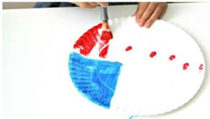
Paper Mosaic Flag