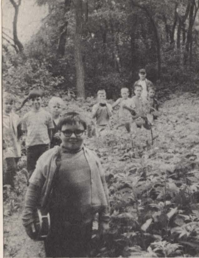
On a trail hike, these Buck-A-Roos were warned "Watch out for poison ivy."