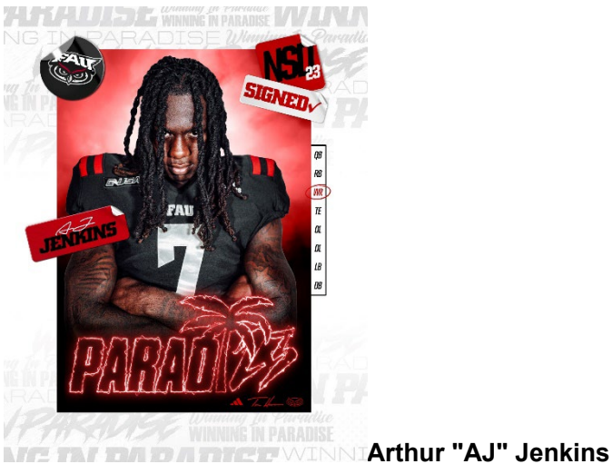
Freshman | 6-3 | 190 | WR Fort Lauderdale, Fla. | Dillard High School