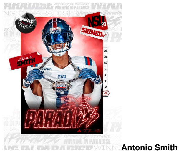
Freshman | 6-3 | 190 | S Miami, Fla. | Gulliver Prep