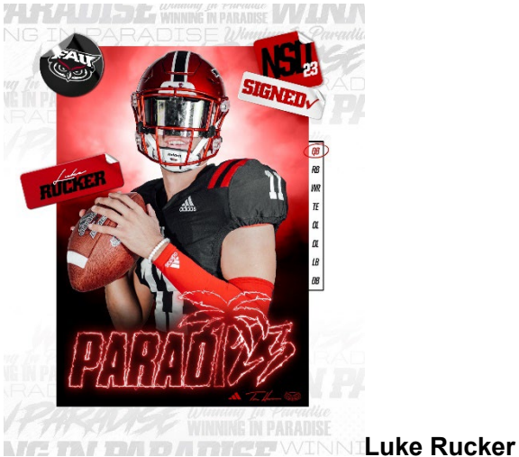
Freshman | 6-4 | 200 | QB Sanford, Fla. | Sanford Seminole High School