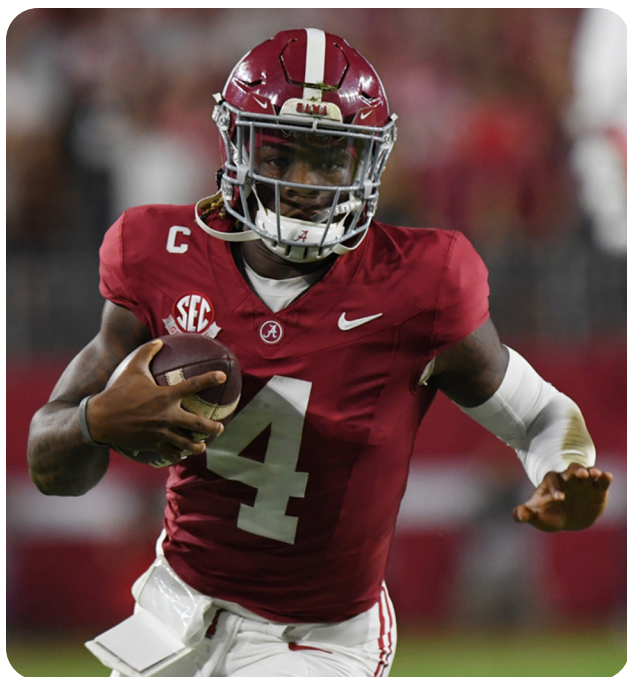
ALABAMA QB JALEN MILROE