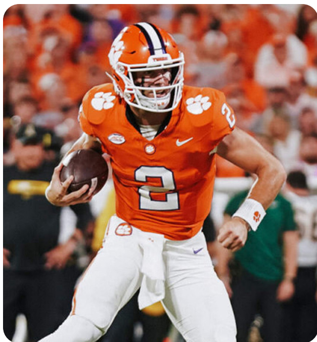
CLEMSON QB CADE KLUBNIK